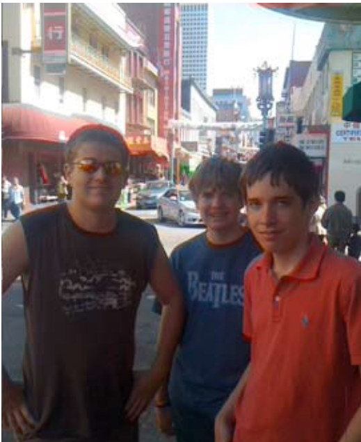
The boys in Chinatown, San Francisco, July 25, 2008