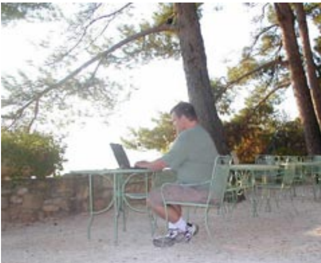
7:00 AM. France. On the terrace. Wireless.

(See my web site, www.wambooli.com for more info on the books and DVD when they're available.)