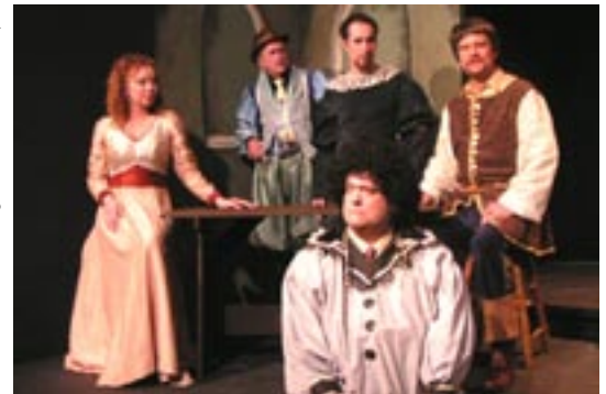
Me as "Man 2" in Kiss Me Kate , February, Lake City Playhouse

This year I also decided to fight the beast and took on the local Urban Renewal Agency. My investigation uncovered some odd and humorous things. I then presented a slide