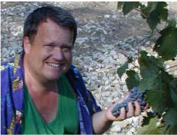
Sampling the grapes at Chateau la Canorgue

In November I had the opportunity to do a Windows Vista training DVD. It's video training! I flew to Chicago and worked with some wonderful people at Class On Demand. The DVD will