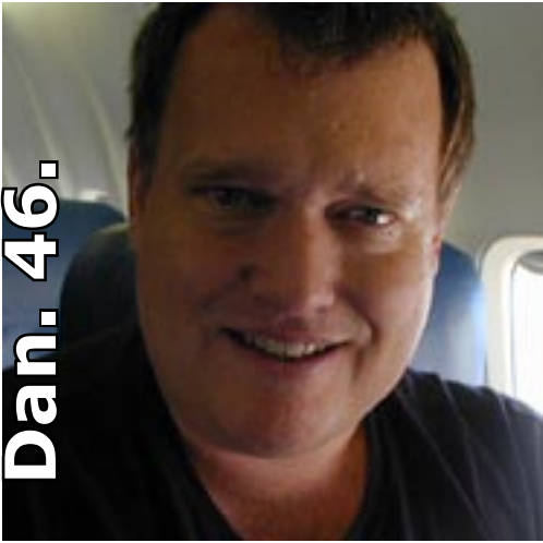
On board the plane to France

I enjoyed 2006, I really did. I decided to go back to work writing computer books. I will have written four before the end of the year. Three are updates, and one is a totally new programming book that I'm really excited about.