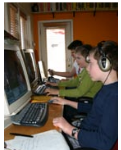
Computer gaming at Dad's.